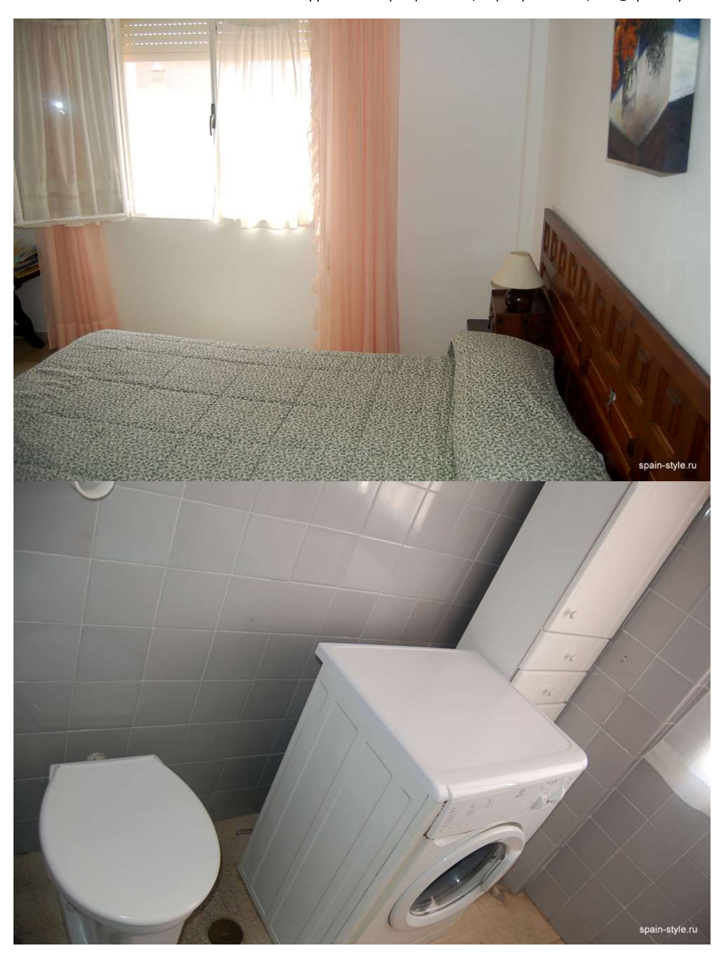
Penthouse near the beach in Almuñecar http://spain-style.ru/en/catalog/almunecar/atico-almunecar1/index.php