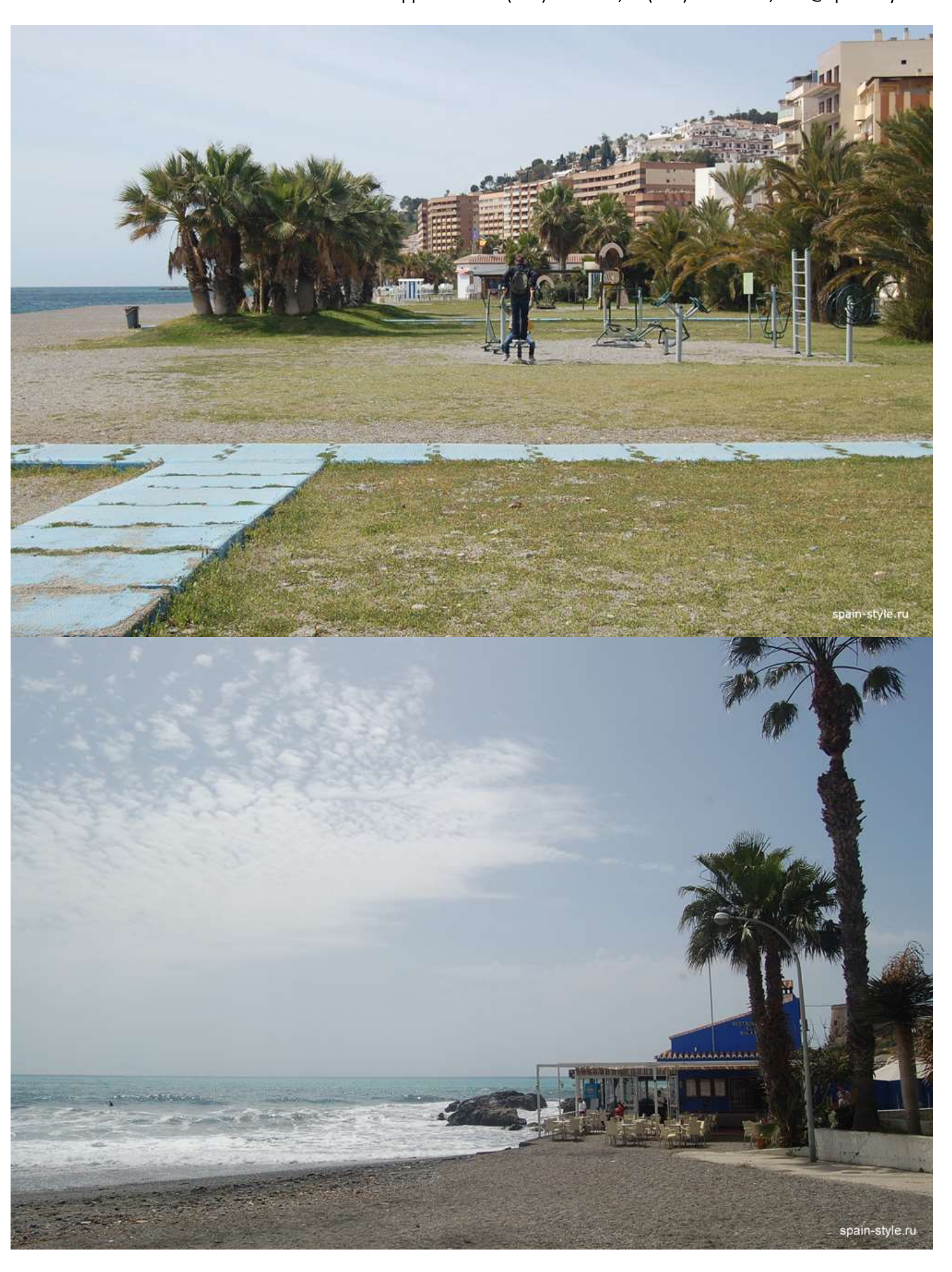
Penthouse near the beach in Almuñecar http://spain-style.ru/en/catalog/almunecar/atico-almunecar1/index.php