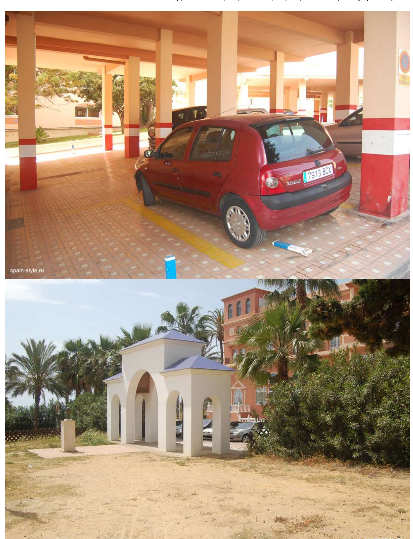
Penthouse near the beach in Almuñecar http://spain-style.ru/en/catalog/almunecar/atico-almunecar1/index.php