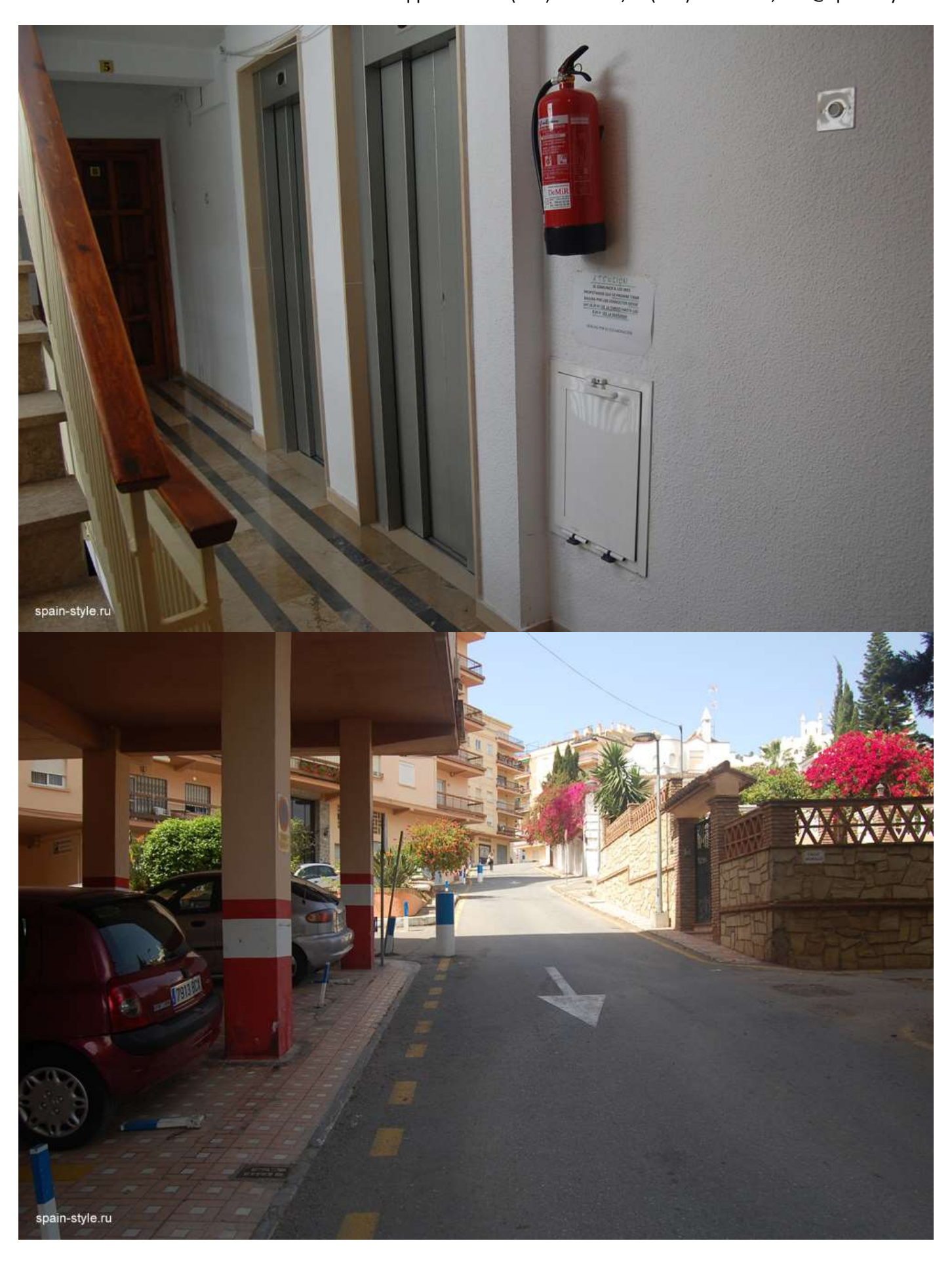
Penthouse near the beach in Almuñecar http://spain-style.ru/en/catalog/almunecar/atico-almunecar1/index.php