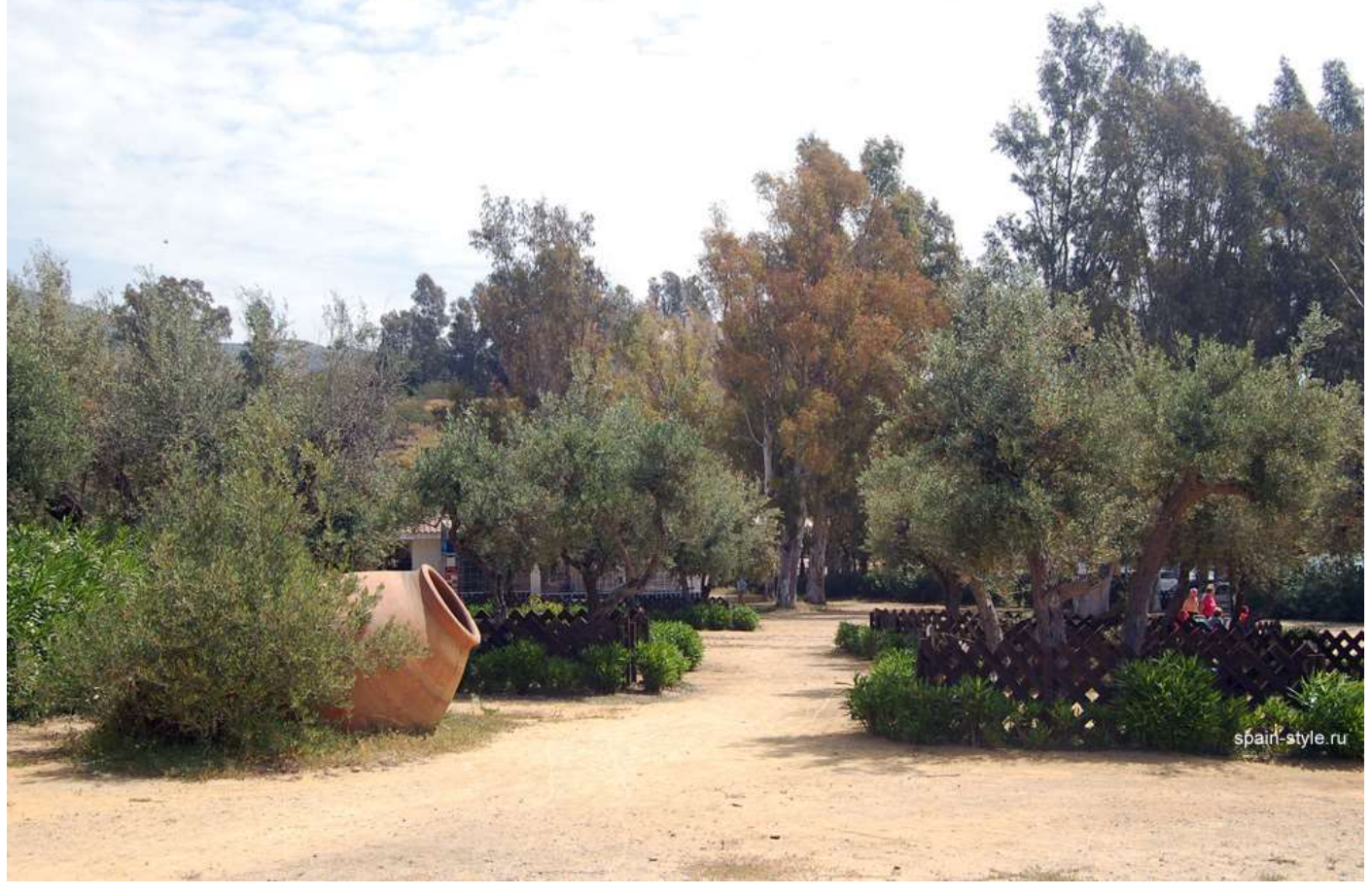
Penthouse near the beach in Almuñecar http://spain-style.ru/en/catalog/almunecar/atico-almunecar1/index.php