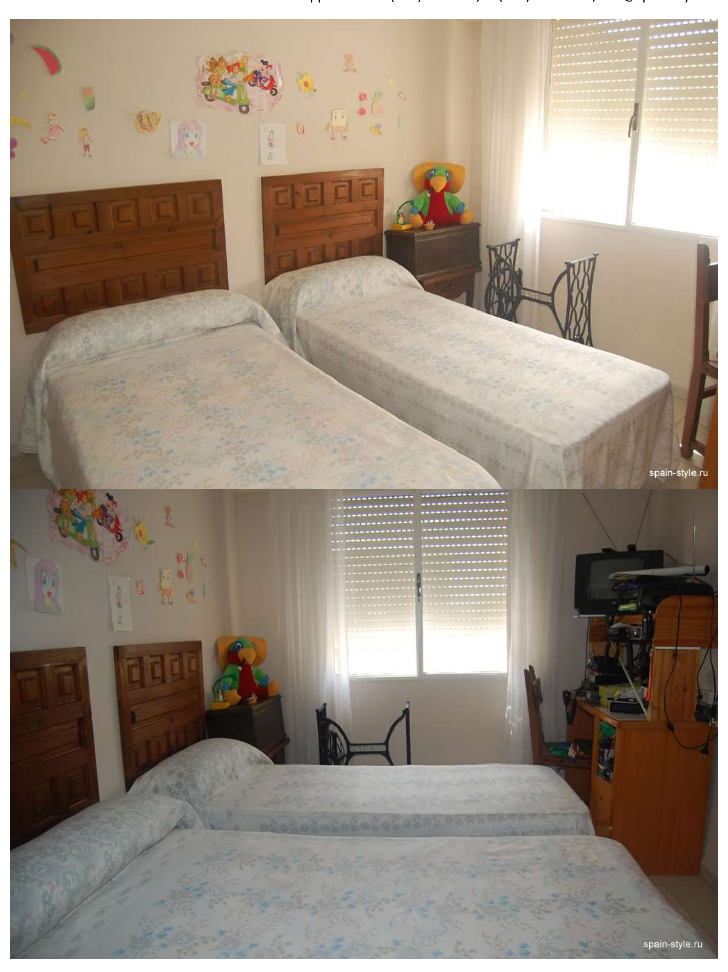
Penthouse near the beach in Almuñecar http://spain-style.ru/en/catalog/almunecar/atico-almunecar1/index.php